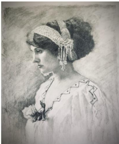
Art by Lauren Peterson

FL18-ARCH-1B Oct 31, Nov 7, 14, 28, Dec 5, 12