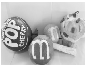
Pop Art by Zeuch's Students

K-WS20-BUCH-3C Apr 16, 23, 30, May 7, 14, 21