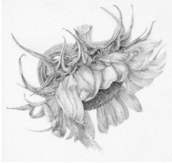
ART BY SUE WEGENER