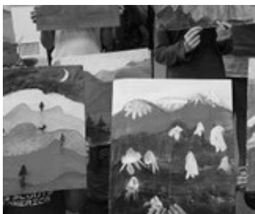
Art by Zeuch's students