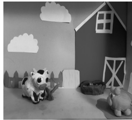
Clay Animation Art by Zeuch's Students

K-WS20-ZEUC-2C Apr 14, 21, 28, May 5, 12, 19