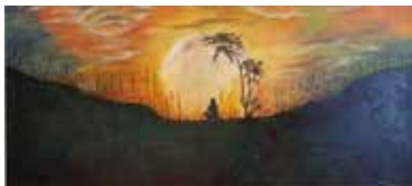
Myrium Villatta Elijah, "Untitled (Prairie Scene)"