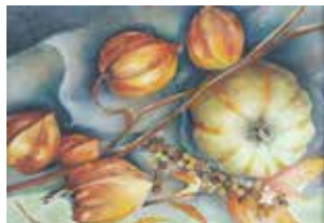
Beverly Miotke, "Orange for Autumn"