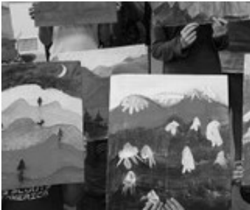
Art by Zeuch's students