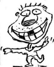
Art by Charles Welch