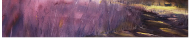
The Shadow Greet the Light