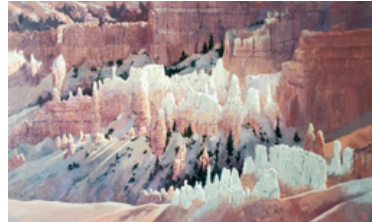
Dale Olsen, "Bryce Canyon Cathedral"