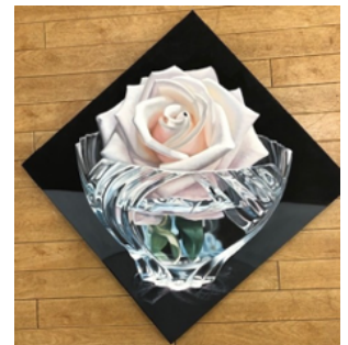
Special Merit: Marge Hall "Crystal Clear," Oil