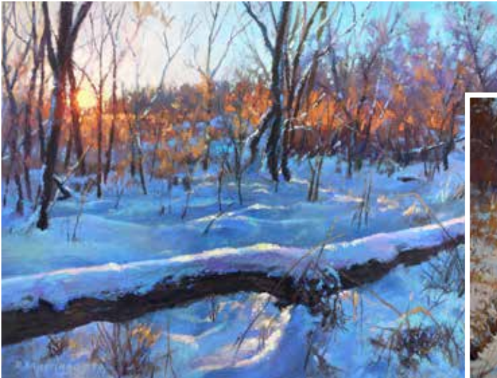
Awakening 9" x 12"