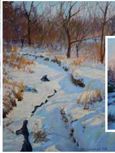
Upon the Creek Bed 16" x 12"