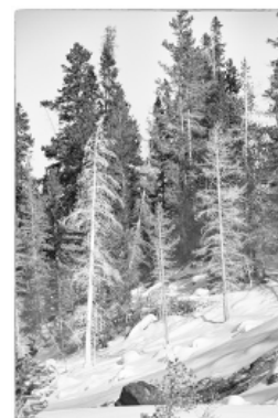
Special Merit: Joan Kalmanek "Wrapped in White," Photography