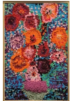
Special Merit: Diana Nawrocki Wall Flower, Textile