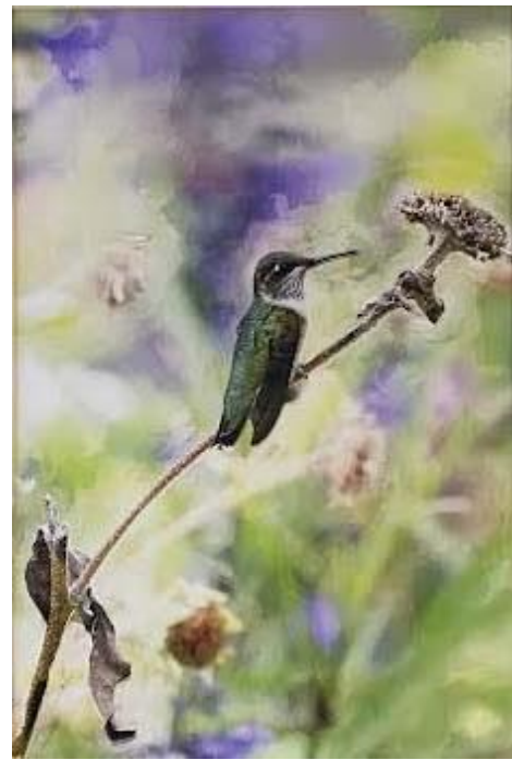
SPECIAL MERIT: Joan Kalmanek Cantigny Hummingbird, Photography