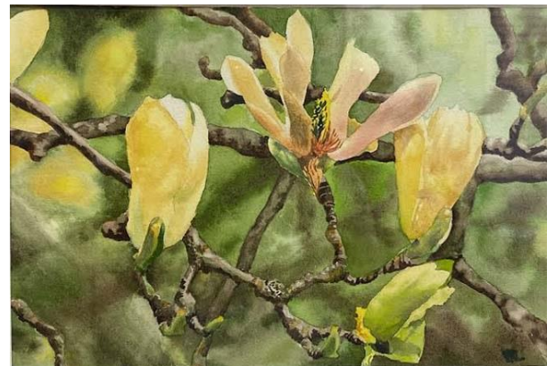
SPECIAL MERIT: Vicki Liszewski Magnolia, Watercolor