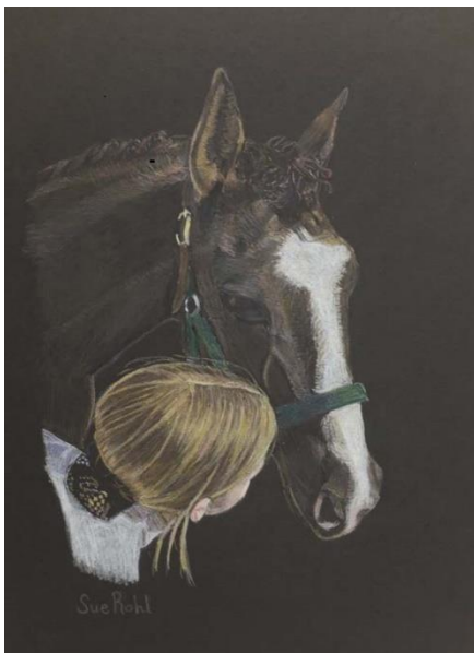
SPECIAL MERIT: Sue Rohl Best Buddies, Colored Pencil