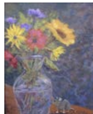
Special Merit: Chris Hughes Flowers Reflection , Acrylic