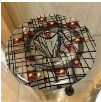
Yvonne Thompson , "Vortex", Fused Glass Yuletide Treasures