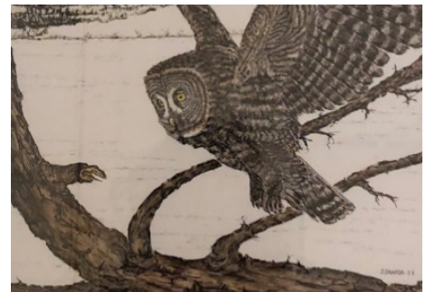
Jeff Zawada , "Grey Ghost", Pen, charcoal, watercolor Front Desk Scheduler