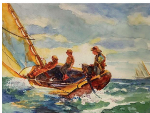
Special Merit: Jan Kloss 3 Boys Instead of 4, Watercolor