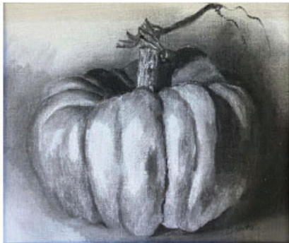
Special Merit: Dawn Halter Pre-Pumpkin Pie, Charcoal

Comments: Beautiful division of the space in the picture. The vibrant red color caught my eye to come close and see the details.