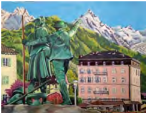
Chamoix Guides, Colored Pencil

Front Street Salon groups and helped to curate Gallery I exhibits at the DuPage Art League.