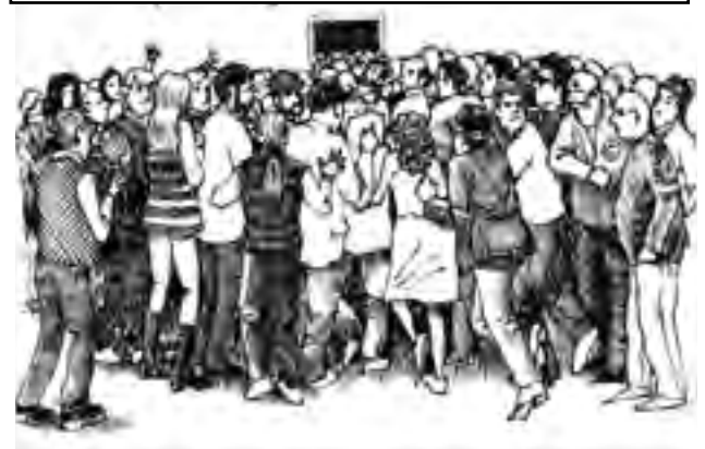
3.01 pm Saturday when new classes are released!