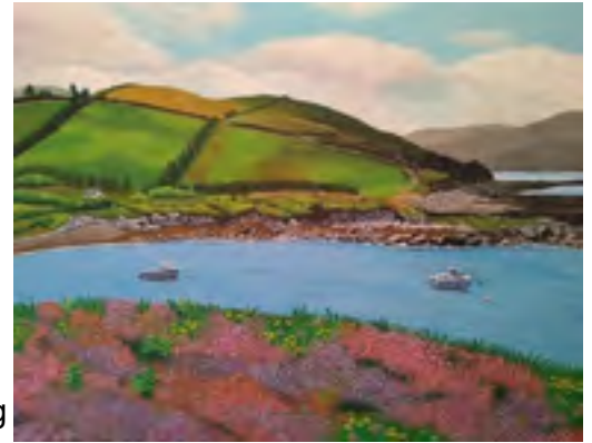
Ring of Beara, Acrylic