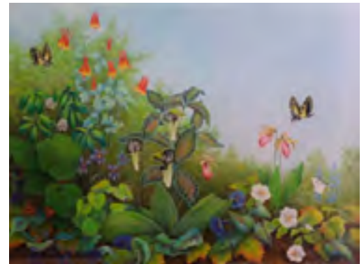
Best Theme: Judith Shepelak Fantasy Garden II, Colored Pencil

Judges Comments: (R) Well done! Speaks to the theme. The attention to detail is outstanding and the perspective of composition work well and creates a sense of space in the image and brings the viewer into the landscape.