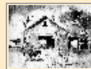
2023 Activity Guide

dupageartleague Gallery, School & Gift Shop 630-653-7090