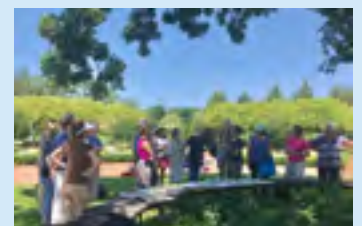
Group At Cantigny July 14 admiring each others' work.

July 28- Wilder Park Conservatory, Elmhurst August 4- Ball Seed Gardens 9:30-12 noon