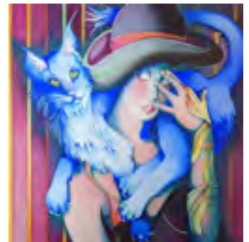
Her Feline Nature 25 x 25, Watercolor

I have always been fascinated by cats. The "cat" series began as drawings using Prismacolor pencils. Watercolors emerged into paintings with scratched surfaces creating a degree of abstraction in the images. My idea is to express the nature of cats going beyond what a cat looks like. You know what I mean if you have ever been owned by a cat!