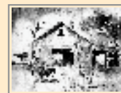
2023 Activity Guide

We are looking for member art for our 2024 Activity Guide. We're giving you lots of time to create a drawing or painting for the cover. Although you may submit a full color file, it will be printed on the cover in one color. submit by Sept. 30, 2023 to: Lori Tucker: dpalmembershipt@gmail.com PS: you win recognition!