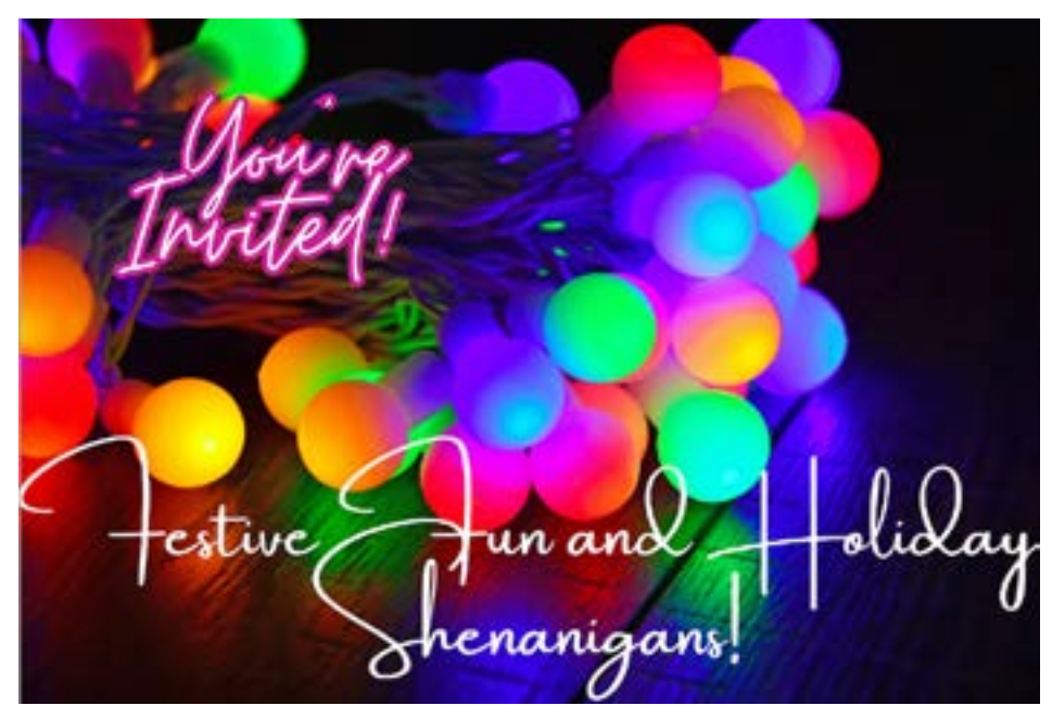
Mark your calendars..... Sunday November 5, 2:00pm - 4:00pm

What a wonderful way to start the holiday season with a fun afternoon at DPAL! Yuletide Treasures will be open too, so you can start some holiday shopping!