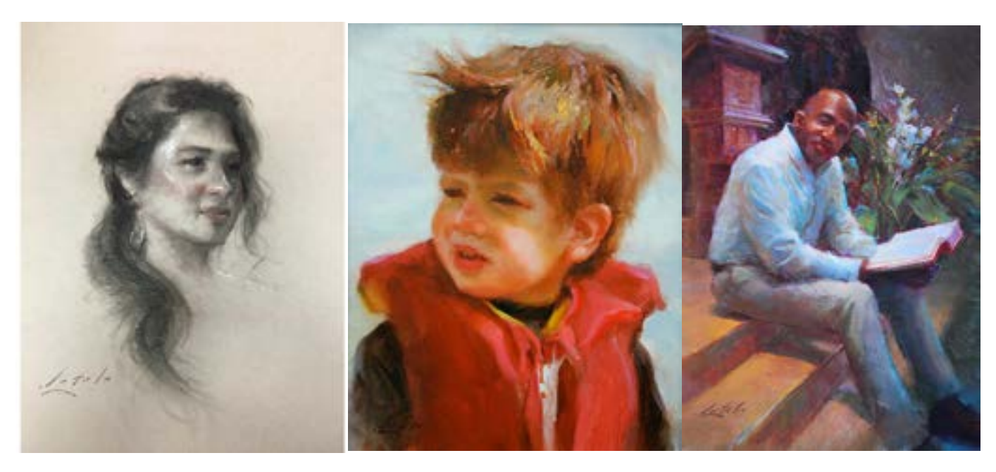
Pastel Portraits Monday, Oct. 16 • 6:30 pm • hybrid

October's Monday Night Program can be enjoyed in person at the Wheaton Library or via Zoom. This is a free program.