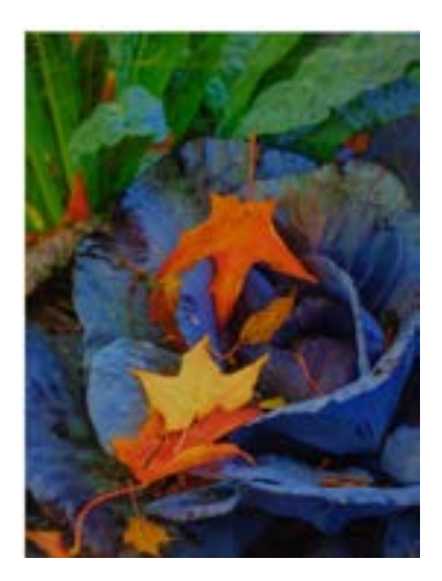
Special Merit: Joan Kalmanek Autumn Leaves, Photo I was immediately drawn to the colors and detail. How you can see the veins on the flowers in the foreground. I like the simplicity of the subject contrasted with the complexity of the subject.