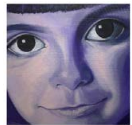
Special Merit: Cindy Mugnani Purple Rose, Acrylic It's a good size, framed interestingly, monochromatic. Hits you from across the room. Nice smile but deep black spooky eyes. Mystery—it's a big statement! Note tonal range! Light out of darkness.

stems hold it all up to the unseen sunlight!