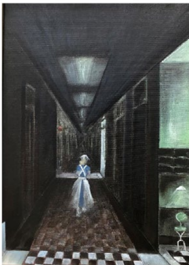
Honorable Mention: Ardythe Tiesenga, Oak Park, IL, Oak Brook Art League, "Nite Nurse," 14x16", Oil, NFS