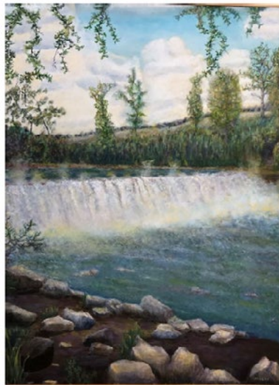
Special Merit: Ken Kucera, Waterfall, Oil

Comments: This captivating piece reveals a wildly interesting story between a man and a woman. The energy between the two figures and the use of color to identify them is riveting making the viewer wonder, "is this a welcome or an unwelcome visit?"