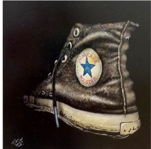
Theme Award: Tom Finn, Chuck Taylor All Stars, Scratchboard

Comments: Using the technique of traditional Chinese brush work on rice paper, Alice has captured a scene of natural beauty with the graceful swooping of many cranes. Beautifully rendered with great detail, both in foreground and background, Alice has created an arresting image filled with detail for the viewer to admire. Her judicious use of color helps both ground the eye yet give the piece aerial motion. Although the main focus is bird activity, the sturdiness of the city wall and pavement bricks below add cohesiveness and stabilization.