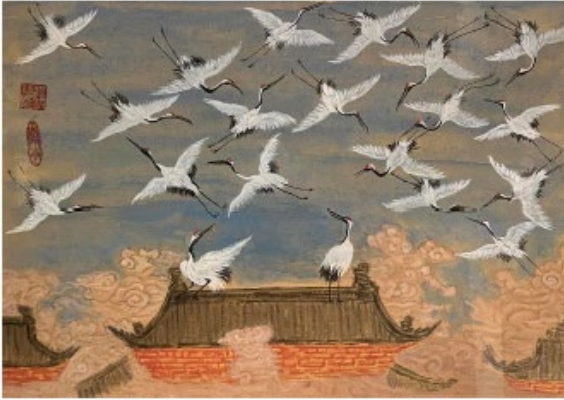
Best of Show: Alice Matthews, Over the Forbidden City, Chinese Brush

Comments: Using the technique of traditional Chinese brush work on rice paper, Alice has captured a scene of natural beauty with the graceful swooping of many cranes. Beautifully rendered with great detail, both in foreground and background, Alice has created an arresting image filled with detail for the viewer to admire. Her judicious use of color helps both ground the eye yet give the piece aerial motion. Although the main focus is bird activity, the sturdiness of the city wall and pavement bricks below add cohesiveness and stabilization.