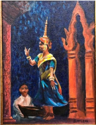
Camodian Dancer By Susan McLean Front Desk

The orders of the DPAL Spring / Summer Apparel should be ready for pickup in a few days. If you ordered, you will be notified when you can pickup at the DPAL.