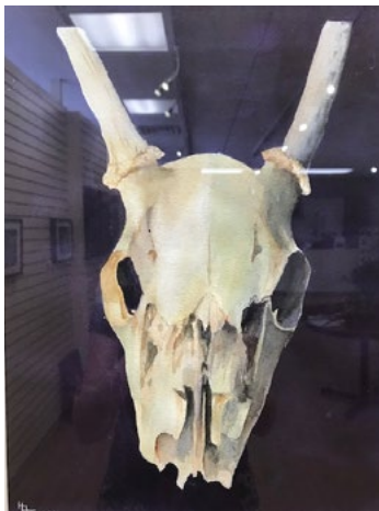
Old Bones, Watercolor By Holly Tysol Front Desk

Please leave your donation in the DPAL library. There is a bin on top of the south side shelves for your books. They will be priced and placed on the for-sale shelf so that others can enjoy them. Please contact me, Ewa Bacon, at baconew@lewisu.edu if you have questions. Many, many thanks to all of you for supporting this venture.