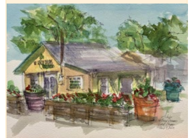
Last year's cover art by Adele Dunn