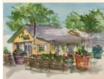
Last year's cover art by Adele Dunn