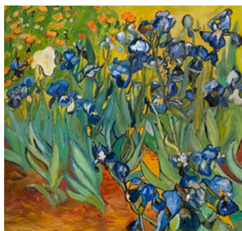
Special Merit - Kyle K Holloway "Irises" Oil