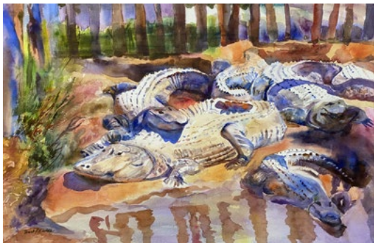
Best of Show - Barb Plichta "Muddy Alligators" Watercolor