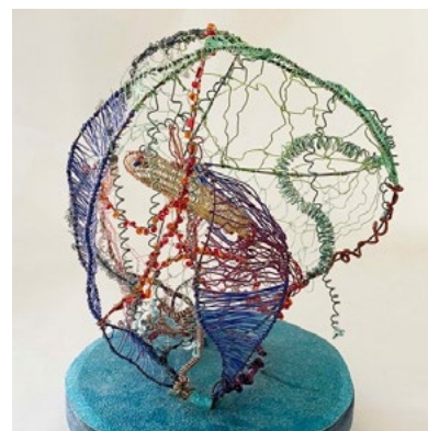
Special Merit - Marline Vitek "Fish" Wire Sculpture