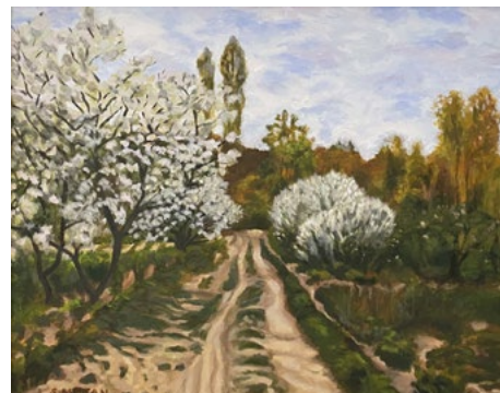
Best Theme - Susan McLean "Monet's Apple Trees" Acrylic