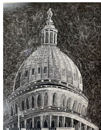
Pam Mitroff "Capitol Dome" Scratchboard