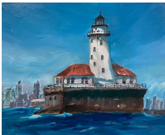
Lynette Hoy "Chicago Harbor Lighthouse" Oil