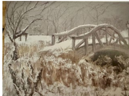
a Snowy Bridge