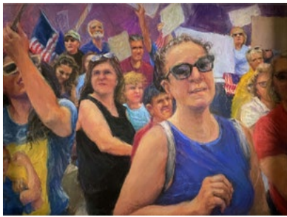
BEST OF SHOW Artist: Fran Puglise Title: Frontline Mamas. Medium: Pastel Comments: This stands out for its strong composition, rich color, and impressive depth. The artist captures an active protest scene with "Mamas" leading and boys and men supporting, creating a powerful sense of movement and unity. The layered figures and confident use of pastel bring the moment vividly to life.