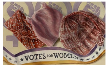
Artist: Benita Brewer Title: And We Rise Repeatedly, Watercolor Comments: This celebrates the courage and solidarity of women, using bold red and powerful symbols to show their determination to keep standing up for their rights.