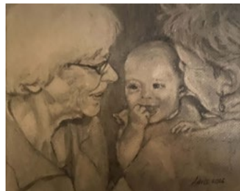
Artist: Adele Dunn Title: Grandmas' Whispers, charcoal Comments: Grandmas' Whispers is a delicate charcoal drawing with soft blending, capturing a joyful moment—a baby cradled between two smiling grandmas, radiating warmth and love