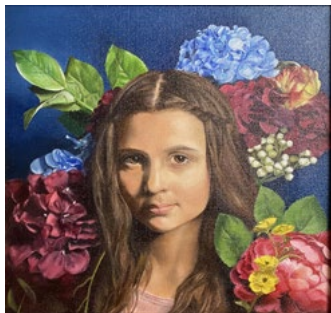
Artist: Natalya Rowland Title: Surrounded by Flowers, Oil Comments: This painting has a captivating blend of mystery and vibrancy—the girl's Mona Lisa-like expression paired with delicate textures in her hair and the surrounding blooming flowers creates a moment full of grace and life.